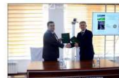
In 2019, 29 may, Signing of a memorandum between Bukhara State University and the Academy of Economics named after D.A. Tsenova Bulgaria.