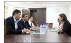
In 2019, 16 may, visiting member of Vatel International Business school Hotel & Tourism of France.

BukhSU is cooperating with higher educational institutions and scientific research centers from more than 45 foreign countries. This cooperation is expanding day by day.